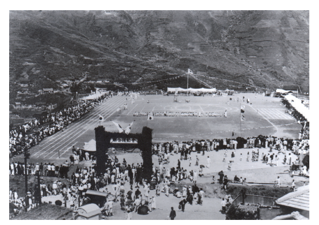
[Figure 3] Jinguashi Sports Meeting (Provided by Zhang Yingjie, assumed to be late 1930s)