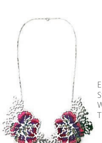
Embroidery – Pixel 3.3 Stainless Steel Plated With Platinum, Thread, Silk Organz

His works, "Floral Embroidery Pixel Series" brooch, are in the collection of Museo degli Argenti, Italy.