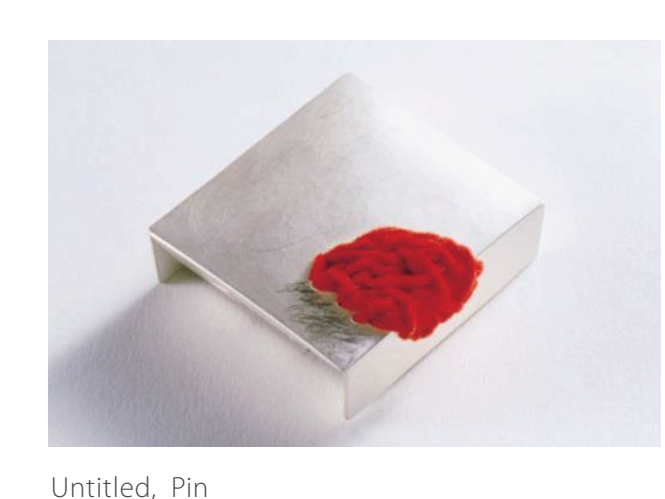
Sterling Silver, Velvet Line 3.5×3.5×1cm 2003

promote the value of handmade. They run "MANO Select" shop in Taipei city.