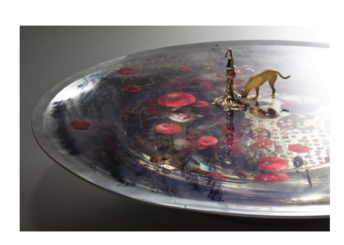
The Mirror, object Fine Aluminium, Brass, Bbrass Wire, Mirror, Epoxy, Anodized Aluminium 45×45×16cm 2008