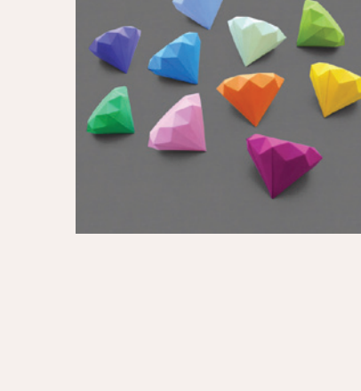
Hearts & Arrows Diamond Origami

Free offer advance booking required, available for 40 People