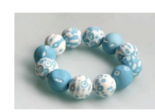
Porcelain, Silver, Nylon Ø 4.9×12cm 2009

Her works have been collected by Montreal Museum of Fine Arts, Canada, Musée des Arts Décoratifs et de la Mode, Marseille, France, and Museum of Art and Design (MAD), New York, U.S.A.